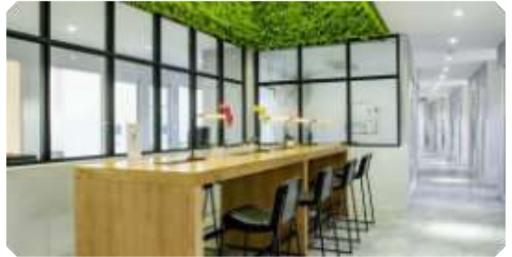
Business Lounge - Synergy Desks