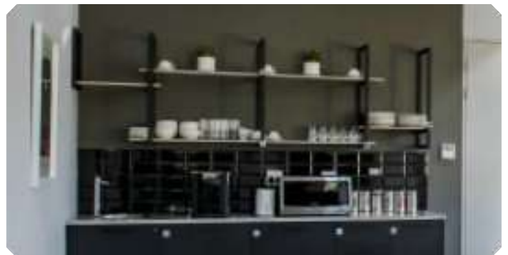
Fully Equipped Kitchens on Each Floor