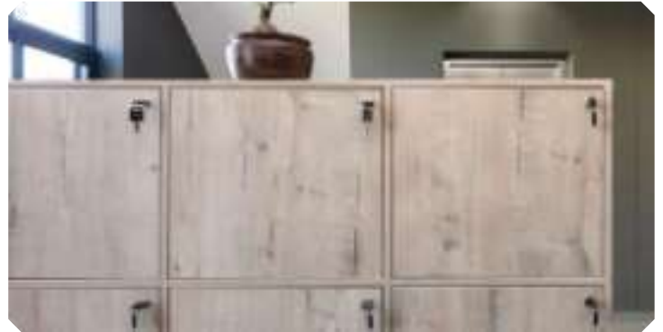
Storage Rooms & Lockers