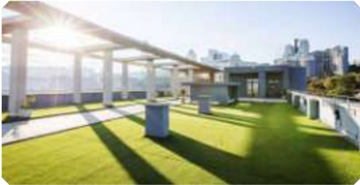
MAX Roof Top Venue