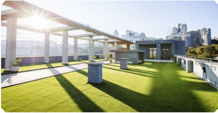
MAX Roof Top Venue