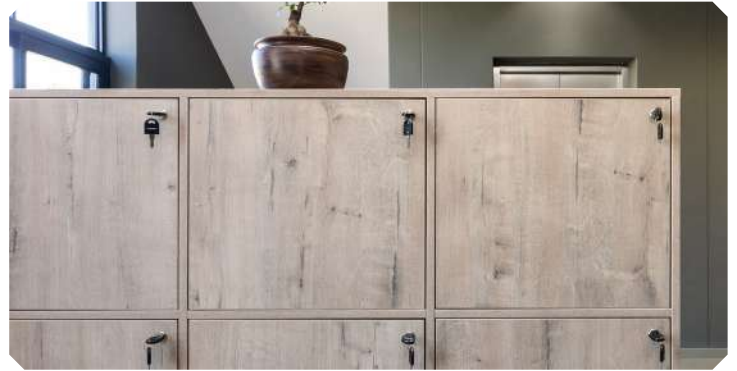
Storage Rooms & Lockers