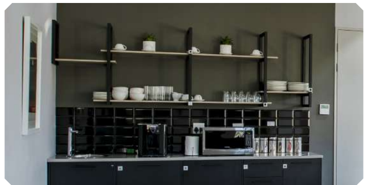
Fully Equipped Kitchens on Each Floor