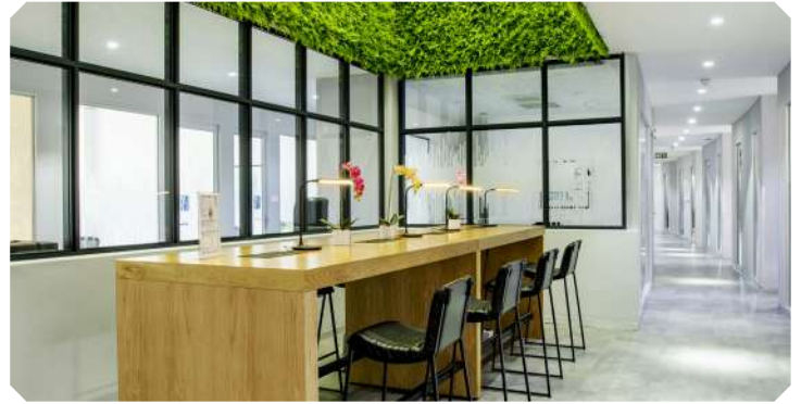
Business Lounge - Synergy Desks